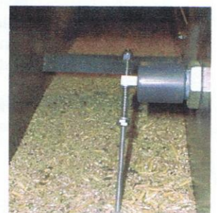
Product "stream" showing high speed separation of contaminants, including ergot and various weed seeds.