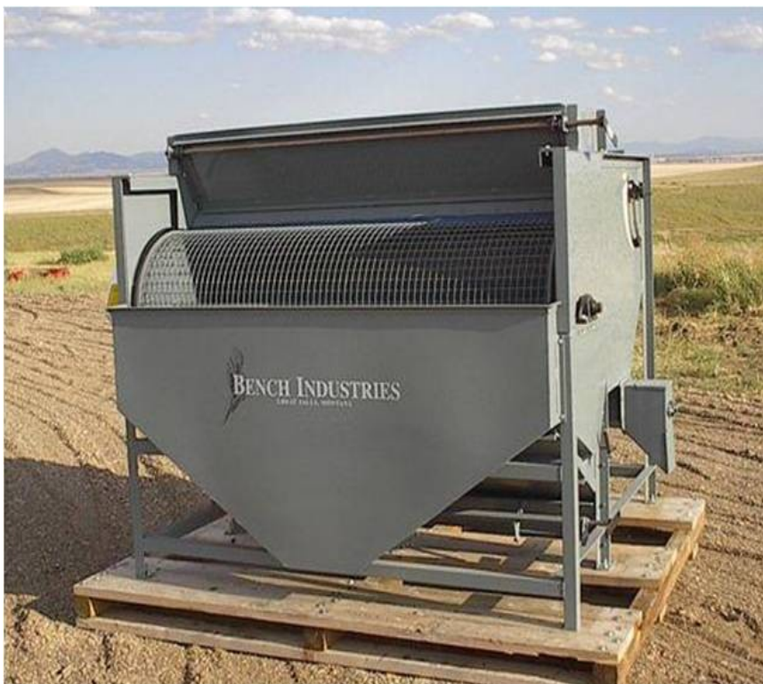
Model Shown is SA-2472

The scalper screen is the tri-bar material for longer wear life and with the variable speed control is easily changed for a wide variety of products ie. (corn, wheat, alfalfa, canola, & recycling plastics.)